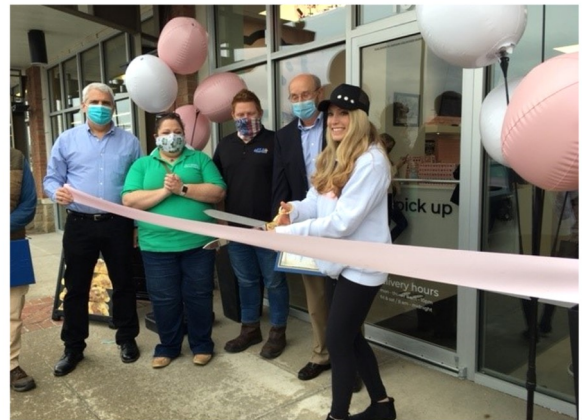
Crumbl Cookies 12949 Shelbyville Rd. #102